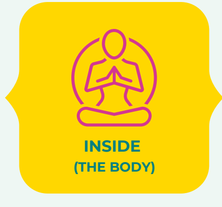
INSIDE (THE BODY)

Neuroception listens to three streams of input: inside (the body), outside (the environment), and between (others' nervous systems).