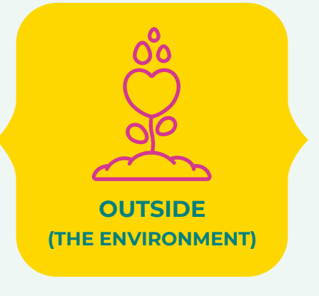
OUTSIDE (THE ENVIRONMENT)